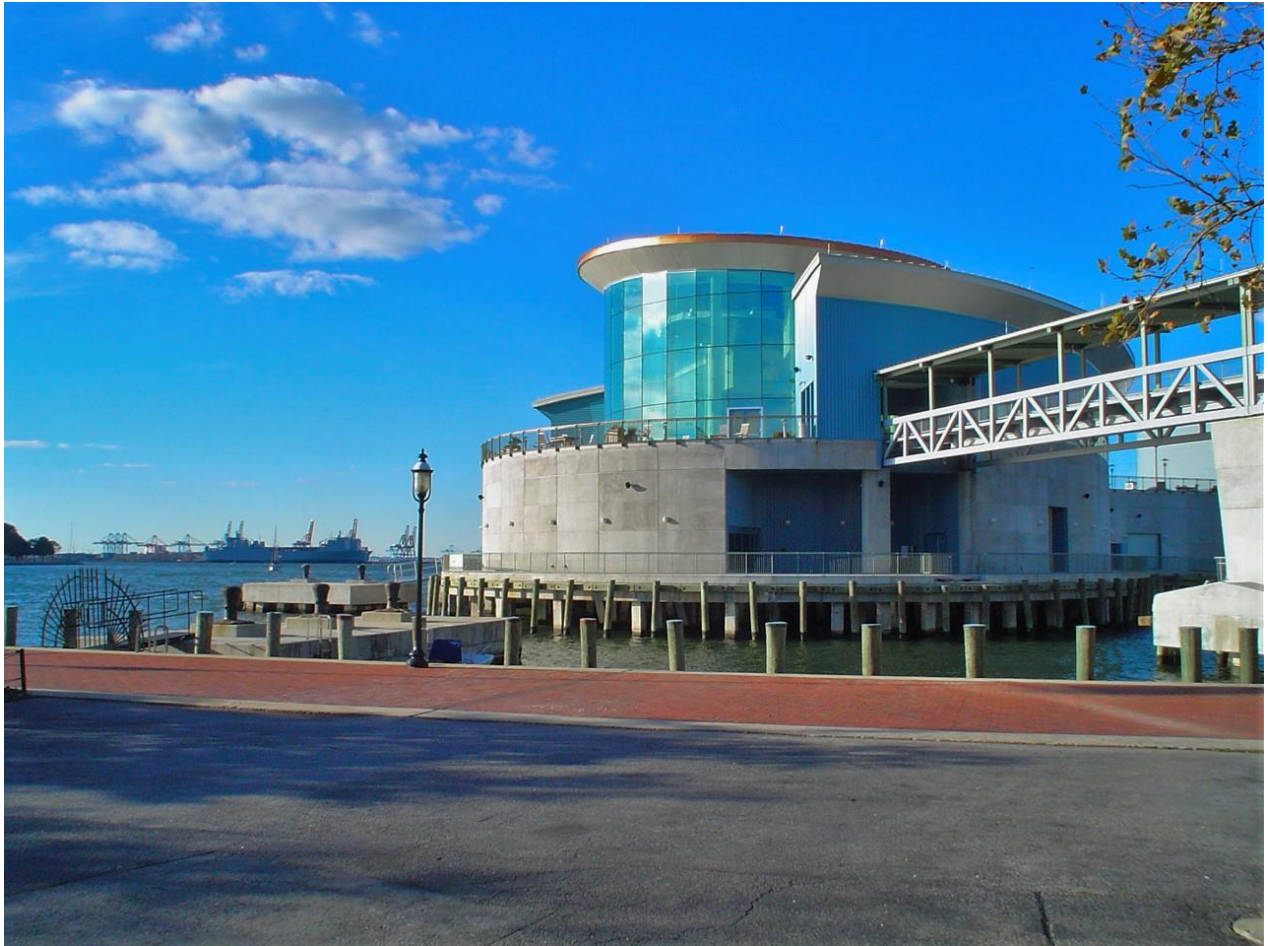
Norfolk Cruise Terminal, Norfolk, Virginia

MAP is routinely involved in the regulatory coordination and permitting for a variety of waterfront projects. Recently, MAP assisted the Department of Game and Inland Fisheries with the Federal and State permitting for the Princess Anne Wildlife Management Area boat launch facility.