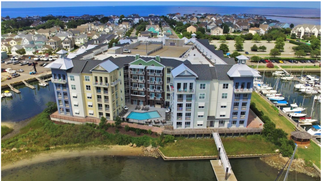
East Beach Marina and Apartments Mitigation, Norfolk, Virginia

MAP has shepherded several mitigation projects over the last three decades. From concept to completion, MAP has led mitigation as principal environmental consultant and/or advisor on various wetland mitigation projects throughout Hampton Roads.