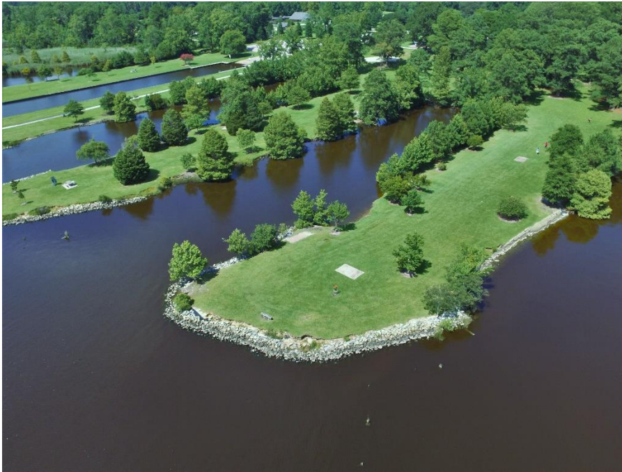
Munden Point Park Virginia Beach, Virginia

We offer our clients a variety of services and options. Examples of our services are listed below: