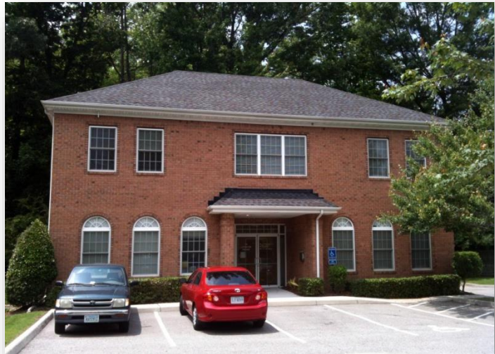
MAP Environmental Inc. Headquarters Virginia Beach, Virginia

As with any professional consulting company, our clientele is the lifeblood of our business. Our growing list of clients includes both public and private companies in the Hampton Roads area and other parts of Virginia.