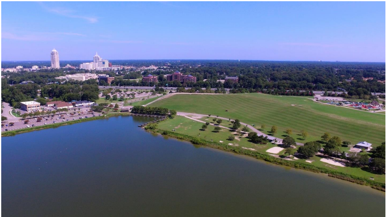
Mount Trashmore Park, Virginia Beach, Virginia

MAP also has significant experience with Parks and Recreation projects. One of our more notable projects is the Mount Trashmore Park, which is frequented by over one million visitors annually. Since 2000, MAP has performed wetland compliance studies at Lake Trashmore at the park. Currently, MAP provides environmental services for the City of Virginia Beach – Parks and Recreation Annual Services Contract with Clark Nexsen.