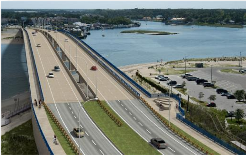
Lesner Bridge Replacement Project, Future Rendering

From bridge replacements to roads and tunnel expansions, MAP has garnered significant transportation experience. An example of our recent transportation work is the Lesner Bridge Replacement Project in Virginia Beach, Virginia. Following the completion of the Federal Highway Association (FHWA) and Virginia Department of Transportation (VDOT) approved Environmental Assessment in October 2009, MAP assisted in the procurement of the Finding of No Significant Impact (FONSI) in November 2011. MAP procured the Federal and State permits on this project in 2013. Construction began in spring 2014, and MAP is shepherding all federal and state compliance monitoring until project completion (scheduled for 2017).