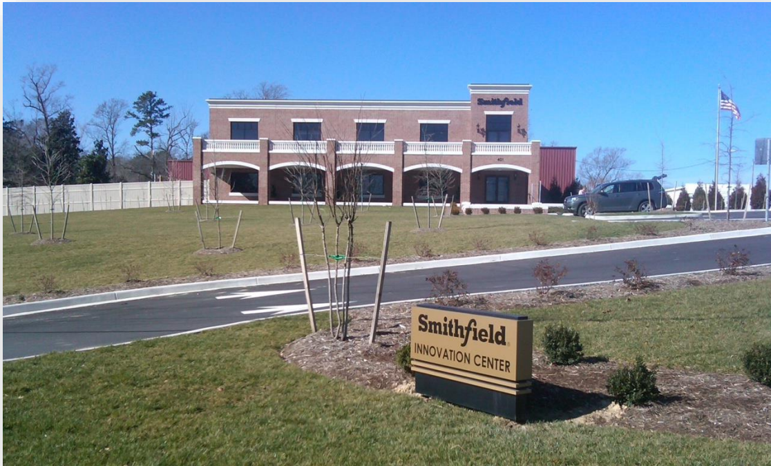
Smithfield Foods Innovation Center, Smithfield, Virginia

MAP has worked on diverse utility infrastructure projects that require various environmental clearances and permits. Since 2006, we have provided environmental consulting services to Smithfield Foods on matters relating to wetlands and water quality. We have provided wetlands identification, delineation, and Chesapeake Bay Preservation Area (CBPA) Services, and secured Federal and State approval for roadways, utilities and storm water improvements near the Pagan River. Recently, MAP was engaged in wetlands permitting and CBPA services for Smithfield's facilities.