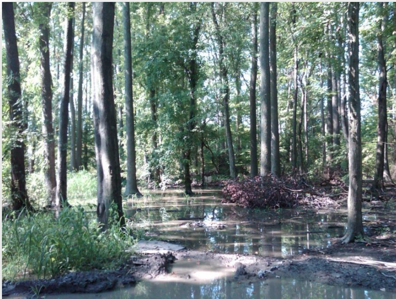
Burton Station, Virginia Beach, Virginia

MAP has also worked on various Land Development projects. We have worked with companies that are constructing homes, businesses that are looking to expand, and various government and city officials on public projects. One of our most recent projects regarding land development is the Burton Station Phase III Strategic Growth Area in Virginia Beach. Under the direction of Clark Nexsen, we are handling the environmental permitting and Phase I Environmental Site Assessment on the project.