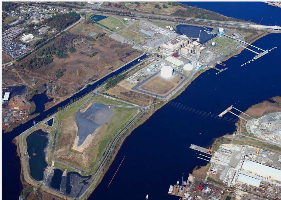
Chesapeake Energy Center, Chesapeake, Virginia

MAP has also worked on a variety of Energy based projects, including Energy Centers, Power Stations, and Oil Transportation projects. One of our recent Energy projects was for the Chesapeake Energy Center in Chesapeake, Virginia. Since 2010, MAP has provided environmental services to Dominion Virginia Power for on-going improvement to its Chesapeake Energy Center (CEC). Most recently, MAP secured the Army Corps of Engineers (COE) approval on wetland delineation studies and required permitting for shoreline stabilization activities along the Southern Branch of the Elizabeth River. Currently, MAP is Dominion's permit manager for the decommissioning of the CEC, scheduled for late 2016.